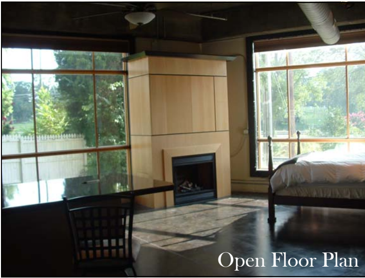
Open Floor Plan