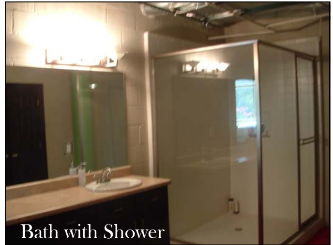
Bath with Shower